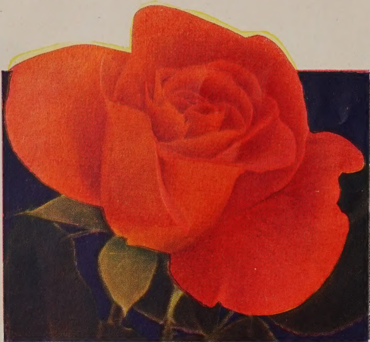
MME. HENRI GUILLOT—$1.25 each; 3 for $3.15 (C-P; Plant Patent No. 337)

FANTASTIQUE —Plant Patent 574. Color is soft-maize-yellow, with the edge of each petal feathered with carmine. The bush is compact growing 18 to 20 inches high and blooms very early and profusely. $1.50 each, 3 for $3.75.